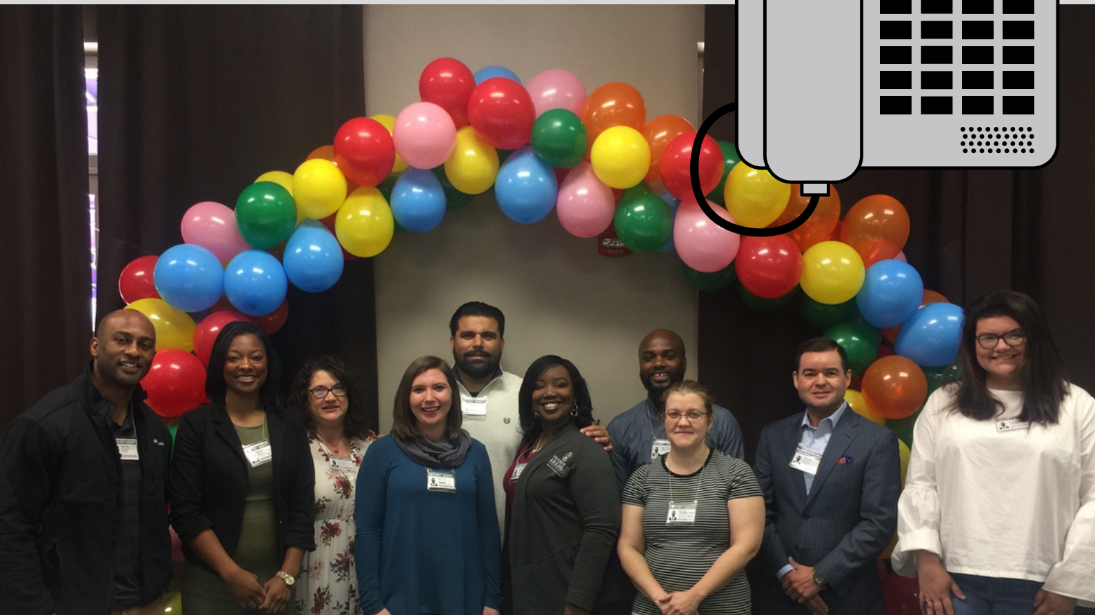
AAACE board members attending 2017 Winter conference